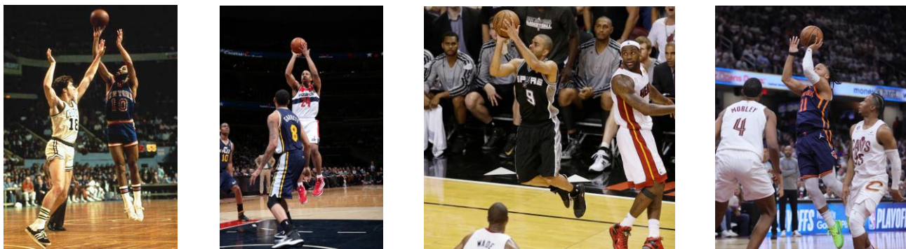
WhB Reachup point guards: L to R, Walt Frazier, Andre Miller, Tony Parker, Jalen Brunson

The whole-body reachup jump shot is another good fit for point guards. The full vertical extension of the reachup jump shot's release is ideal for point-guard play in the middle of the defense. If the momentum buildup from a preceding penetration drive is great, then the reachup jump shot's extension heads out as well as up. Reachup point guards encounter a problem when the strongside penetration pull-up requires more than a minimal square in the air rotation. That's because the reachup jump shot's vertical rotation of the shooting shoulder during the release largely negates the possibility of forward rotation by the shooting shoulder during the release. And no forward rotation of the shooting shoulder during the release means that the reachup jump shot lacks the primary power source for rotating a square-in-the-air jump, which tends to discourage more than soft lateral angle strongside penetration pull-ups. Plus, no forward rotation of the shooting shoulder removes a primary whole-body power source for the release, although whole-body supplementary power production techniques can compensate adequately.