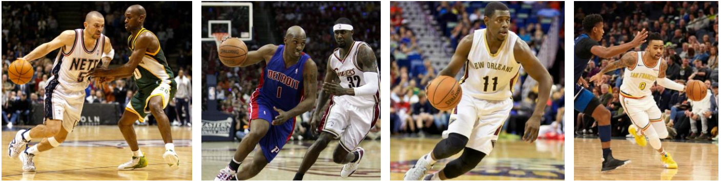
Strongside acceleration: L to R, Jason Kidd, Chauncey Billups, Jrue Holiday, D'Angelo Russell

The shoot-first-pass-preferred tactic should start off with a strongside drive, which has dominant-hand controlled instant and repeatable stop and start capability. The stop is facilitated by a side-to-back dribble, from protection mode to pull-up or torque mode. The start is facilitated by a back-to-side dribble, from torque mode to acceleration. The purpose of the strongside drive is to push back or blow by the point guard's defender in order to make room to shoot a strongside penetration pull-up jump shot, not to get to the basket. Shoot-first-pass-preferred point guards use the one-two combination of a strongside drive and a strongside penetration pull-up jump shot to operate in and dictate from the middle of the defense. After the point guard beats the defender with the strongside drive, the threat of a reliable strongside penetration pull-up jump shot is likely to disrupt the entire defense. The key disruption occurs when the inside defenders leave their primary defensive assignments to confront the point guard's threat of a reliable mid-range or short-range strongside penetration pull-up jump shot.