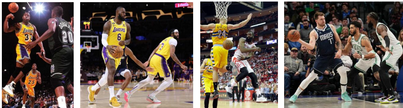
Big men playing point guard: Magic Johnson, LeBron James, James Harden, Luka Doncic

game that is not built around the jump shot. Their skillsets are not identical. But they've all got a good handle and a willingness and an ability to pass the basketball. One way or another, either conventional or by bully-ball, they get into the middle of the defense and make plays. Most of them cannot guard the opposing point guard, but neither can they be guarded by the opposing point guard. Here's a few and how they do it. Magic Johnson thrived on fast break basketball. LeBron James is a locomotive strong and fast slasher and playmaker. James Harden mixes top-notch 3-point and slashing capabilities, but underutilizes his whole-body reachup pull-up as a defense disrupter. Luka Doncic is strong and quick, not fast, though quick translates to versatile, repeatable stop-and-go while fast translates to one-dimensional, one-and-done slashing.