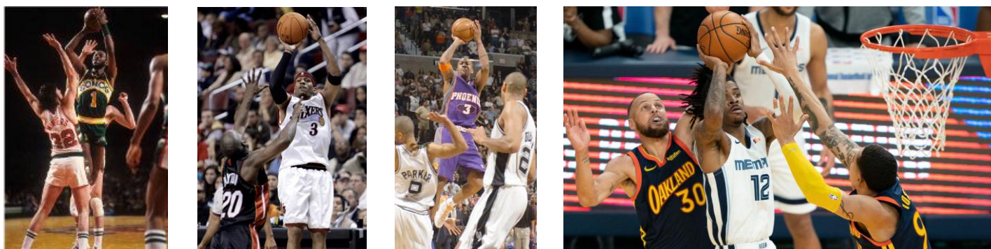
WhB Elbow-out point guards: L to R, Gus Williams, Allen Iverson, Stephon Marbury, Ja Morant

The strongside whole-body elbow-out jump shot provides body-wedge protection of the basketball during the gather for the jump and during the jump of the jump shot. For point guards, such protection is crucial to operating in the middle of the defense, which is where point guards should do much of their business. The elbow-out structure locates the hands, the arms and the basketball back close to the body, which adds more protection and approximates a natural jumping posture. During the whole-body elbow-out jump shot's release, the forward rotation of the shooting shoulder helps to power both the release and the rotation of the square-in-the-air jump that many strongside pull-up jump shots require and all could use. The whole-body elbow-out jump shot's on-the-rise release is early, fast and very much vertical, which is why it reliably beats defenders to the punch. The whole-body elbow-out jump shot's release generates a medium-arc trajectory, which is sufficient to clear even the tall inside defenders.