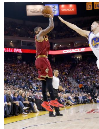
Kyrie Irving's whole-body reachback jump shot: The backward bend of the upper body and the Kobe kick indicate shooting shoulder involvement in the release.

Irving doesn't use his reachback jump shot off to-the-basket moves because the reachback produces backward momentum that clashes with the forward momentum of to-the-basket moves. The reachback's backward momentum and the fallaway jump it induces are ideal for lateral moves. But a fallaway jump is a bad match for to-the-basket pull-up jump shots because they require a vertical or forward jump. That's the reason why Irving regularly shoots a second whole-body jump shot. Irving's second whole-body jump shot, the reachup jump shot, might not have been the championship clincher, but it certainly contributed mightily to the cause.